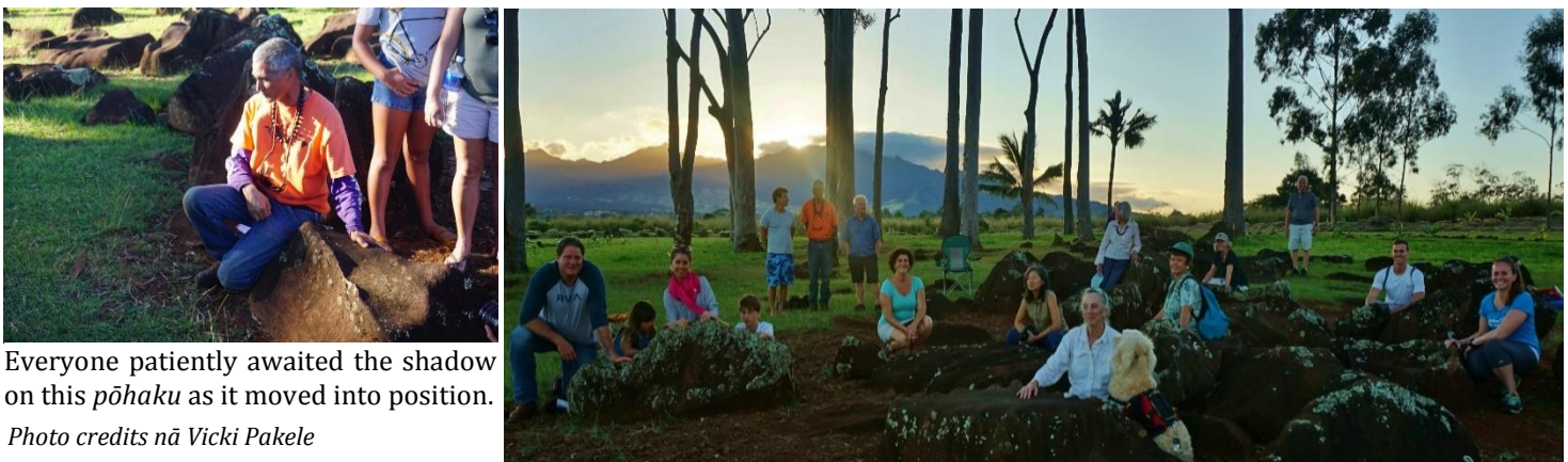
Everyone patiently awaited the shadow on this pōhaku as it moved into position.

03.19.2k17... Several Punahou Alumni Association (PAA) members visit Kukaniloko. "PAA, a private nonprofit organization, exists to organize and participate in education, social, and cultural programs that reach, connect and engage Punahou Alumni community while supporting the core mission of Punahou School since 1906. Alumni meetings are documented as early as 1864." A few members of PAA, as well as a few other visitors, families and friends came out to piko, Kūkaniloko to experience the shadows of this pre-Equinox sunset.