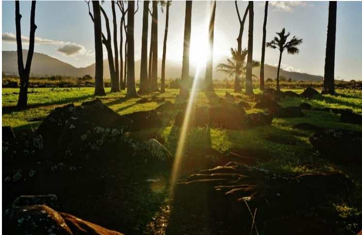
Mahalo kūpuna ma

03.21.2k17...ka māuili o ke kupulau -Vernal or Spring Equinox. The sun sets on this day of 'ano'ai – not one greater than another. This, the time when lā – the light of the day is equal to pō – the mystery of the darkness of the night.