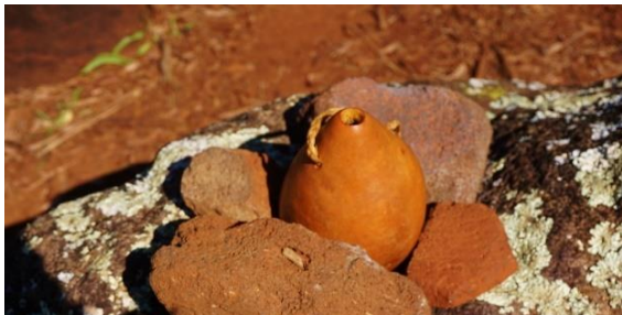
Most precious ho'okupu...Wai - fresh water